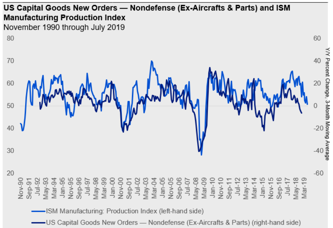
Figure 2: Growth in capital goods orders has been negative, pointing toward further weakness in production